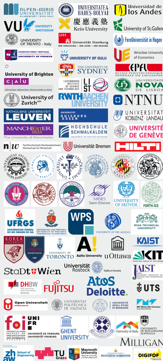
A selection from previous editions.